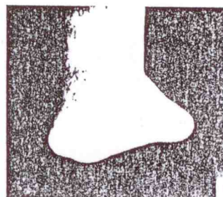
Fig. 1. A case of nonregenerating untreated stump of a forelimb amputated through metacarpal region in a froglet of Rana breviceps .

Discussion. The results provide very definite evidence that even very brief local-treatment of amputated forelimbs of